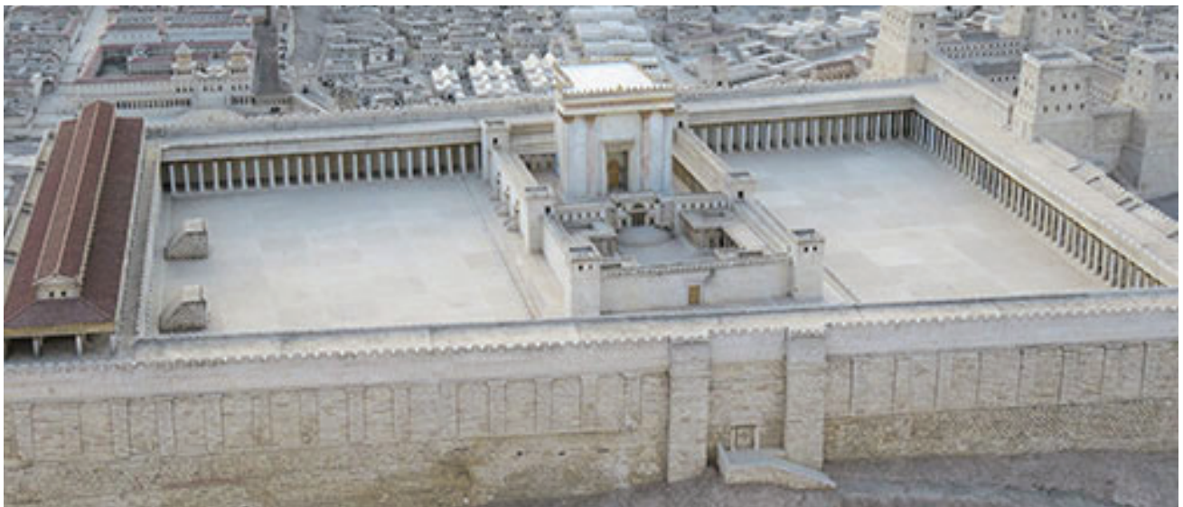
Second Temple, showing all the Colonnades of Solomon's Porch

Solomon's Porch or Colonnade was the name of two porches associated with the temple in Jerusalem. The original temple, constructed by King Solomon, is described in 1 Kings: "As for the house which King Solomon built for the LORD, its length was sixty cubits [90 feet] and its width twenty cubits [30 feet] and its height thirty cubits [45 feet]. The porch in front of the nave of the house was twenty cubits [30 feet] in length, corresponding to the width of the house, and its depth along the front of the house was ten cubits [15 feet]" (1 Kings 6:2–3).